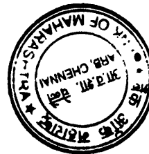
Authorised Officer Bank of Maharashtra