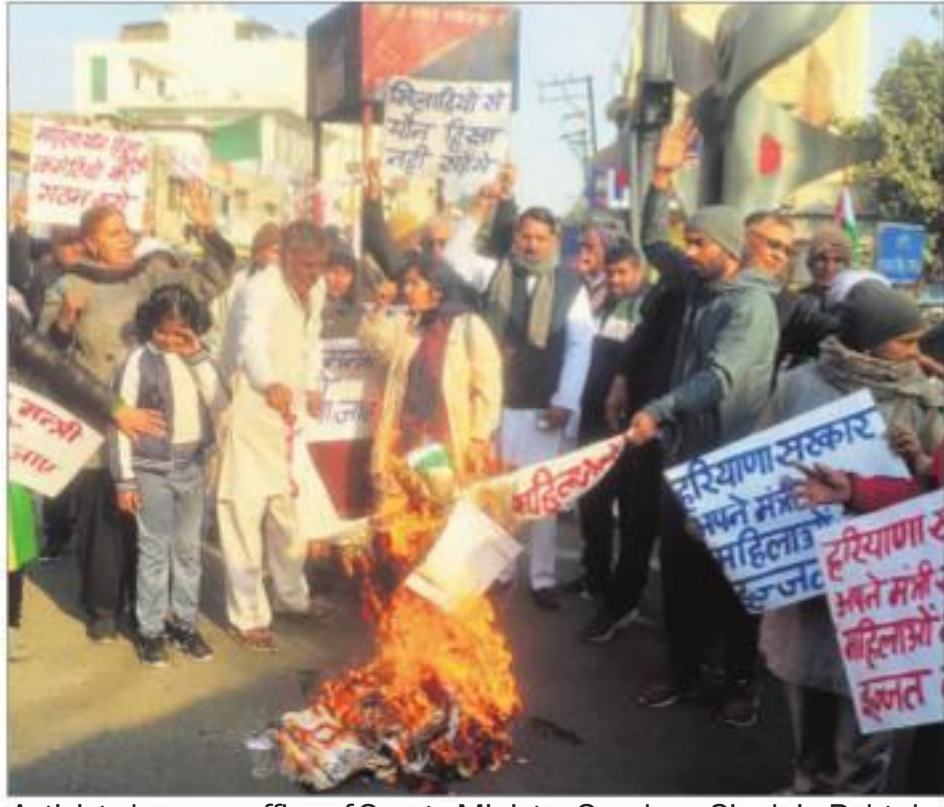
Activists burn an effigy of Sports Minister Sandeep Singh in Rohtak.

On December 30, the woman coach filed a police complaint of the attempt to rape against the minis-