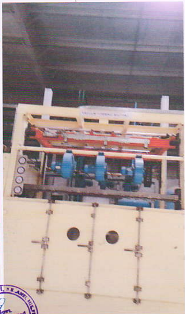
Door Liner Vacuum Forming machine