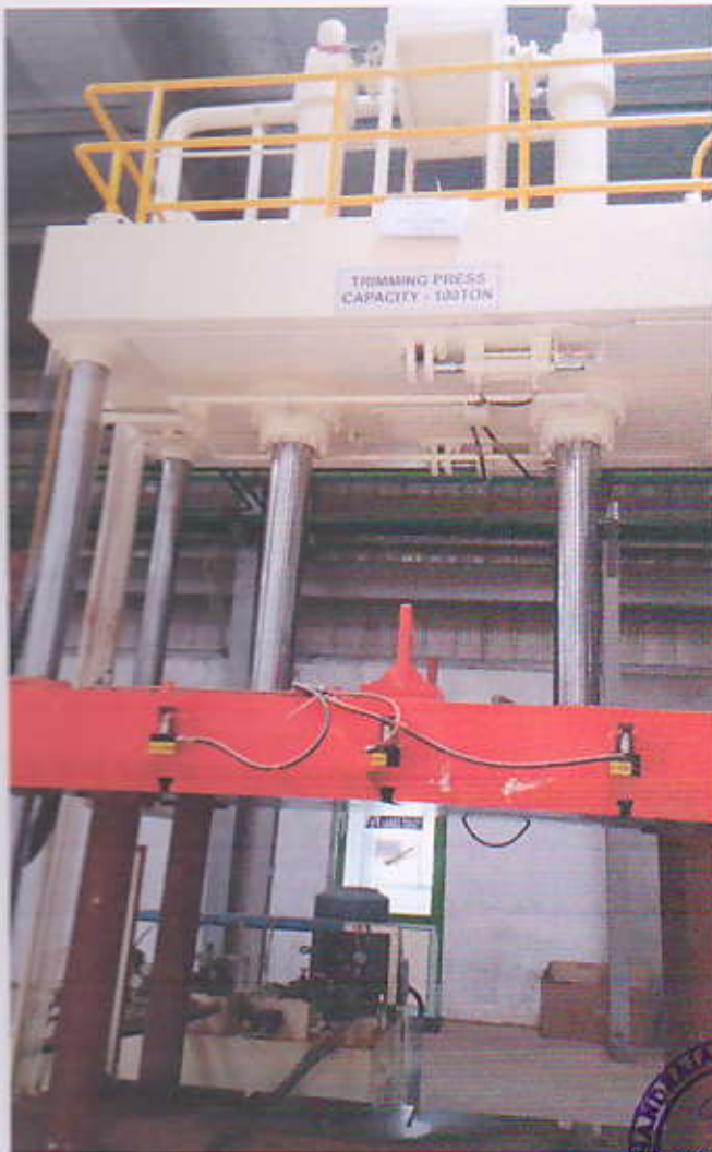
Trimming Press Cap- 100 Tons