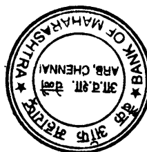
Authorised Officer Bank of Maharashtra