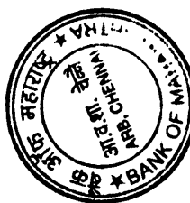
Authorised Officer Bank of Maharashtra