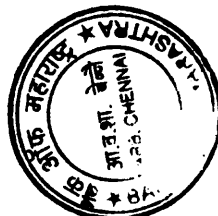
Authorised Officer Bank of Maharashtra